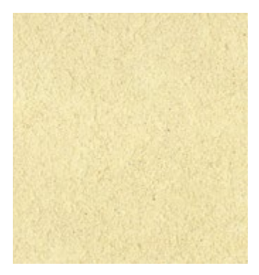
Stolit MP: Coloured fine float, sponge or light adobe finishing render.