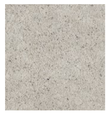
Stolit MP Natural: Coloured fine finish float, sponge or light adobe sand speckled finishing render.