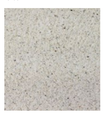
Sto RFP Sponge: Coloured course grained render.